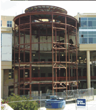
The winter garden atrium's central connection ring (above) was shop fabricated.