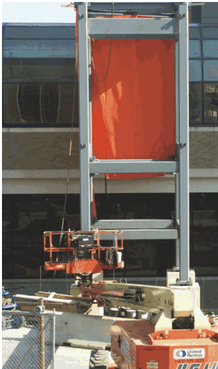
Connector bridges link the new building to the surrounding campus structures.

tion were reanalyzed, reducing the building tonnage by 150 tons, which simplified the lateral member connections and decreased the amount of reinforcing steel and concrete in the foundations.