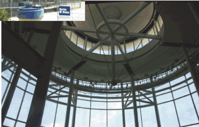
Round HSS tri-columns (visible at left and below) were used around the perimeter to support the façade and the roof structure.

sected existing building expansion joints. To maintain the structural integrity of the existing building structures, a combination of slide bearing plates and post-installed cantilevered beams were installed to support the connection portions for all of the new bridges.